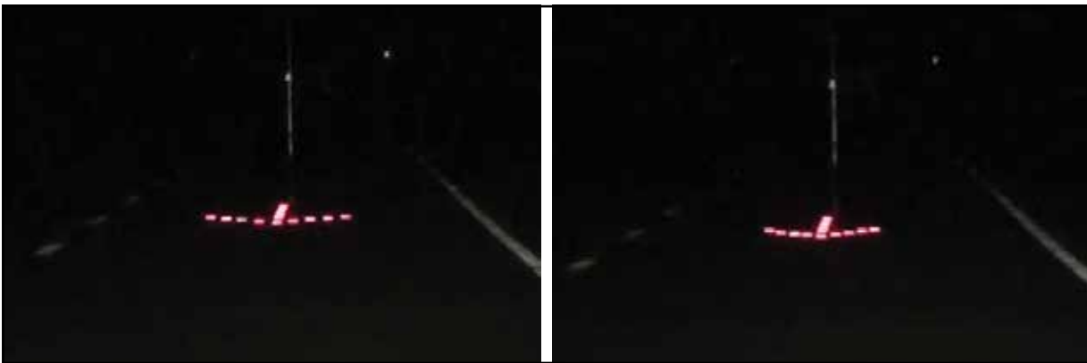
Figure 28: RPM wrong-way arrow standard (left) and narrower (right)

Certain road and interchange geometries may be more susceptible to wrong-way driving due to their layout. One freeway interchange, the partial cloverleaf, can experience wrong-way driving with drivers entering an exit ramp from an adjacent intersection. This situation, and similar ones, can be improved through pavement markings delineating the correct turning movement to avoid entering an approach the wrong way. Figure 29 shows a yellow pavement marking used for left-turning vehicles at the intersection to avoid wrong-way drivers entering the exit ramp of a partial cloverleaf interchange.