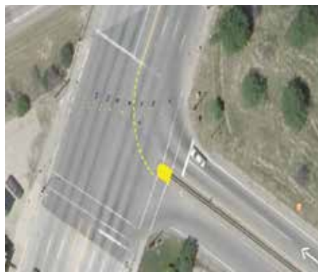
Figure 29: Pavement marking extensions for left-turn movement from crossroad