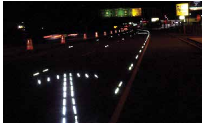
Figure 22: Lighted RPMs for a merge area

Lighted RPMs may be slightly recessed into the pavement in certain applications or made to be snowplow-able in an effort to improve their durability. The color of lighted RPMs is typically achieved using light-emitting diode (LED) technology, and care should be taken to ensure the correct light color as defined in the applicable MUTCD sections dependent upon their intended use. ■