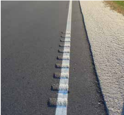
Figure 2: Edge-line rumble stripe with bike gaps

Less evaluation has been completed for profiled markings compared with milled-in rumble strips and stripes, and these markings may be somewhat less effective than milled rumble strips, depending on the dimensions and amount of tactile or audible warning provided. Figure 5 shows an example of a profiled thermoplastic line.