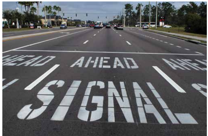
Figure 14: In-lane intersection warning

on the Internet. The test location is near a university, and numerous campus-specific media efforts were also performed, including campus newspapers, university websites, and emails to students and faculty.