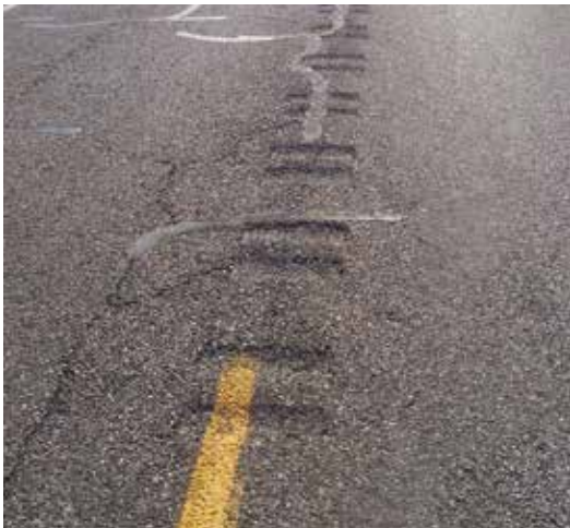
Figure 3: Centerline rumble stripe