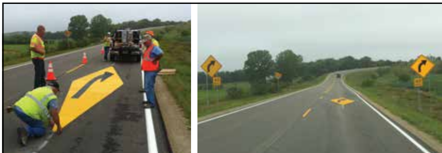
Figure 12: Elongated sign marking for in-lane curve warning

Both of the in-lane pavement markings shown in this section are not directly included in the MUTCD and were both granted experimental status in order to evaluate their performance. ■