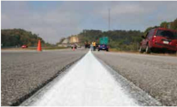
Figure 1. Pavement marking line in a grooved strip

Researchers in Iowa have also documented the benefits of grooved-in line markings. The researchers evaluated water-based paint and high-build water-based paints with different retroreflective bead types on grooved and non-grooved surfaces. The practice of grooving the surface for painted lines was found to extend the life of the marking up to two years. The grooved-in lines are more durable, as they are somewhat protected from traffic and winter maintenance activities. Both the Iowa Department of Transportation (DOT) and the Minnesota DOT have changed their marking installation practices after learning of the benefits of the grooved-in lines. Figure 1 shows a longitudinal marking line in a grooved surface.