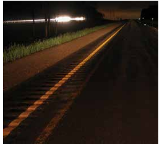
Figure 4: Rumble stripes in dark, wet conditions after a winter season