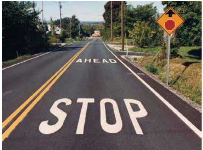
Figure 13: In-lane intersection warning

The evaluation of the marking was performed near Orlando, Fla. An untreated intersection was also used that did not receive the treatment but was monitored as a control. Both intersections were on the same three-lane highway with the same geometries and speed limits. A media campaign that was intended to inform the public about the use of the markings was performed four months after the installation. This media campaign was focused on how the marking was supposed to function in helping drivers decide to stop or go at the changing signal. The media campaign included public TV coverage, newspaper articles, and content published