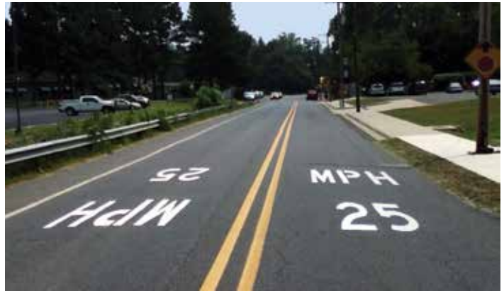
Figure 15: Traditional in-lane markings by Hot Springs, Arkansas Public Works

Two additional Iowa communities installed treatments during the more recent project, one with markings to slow vehicles from 55 mph to 35 mph and one to slow vehicles from 55 mph to 25 mph on the edges of the communities. During this evaluation, speeds were collected before, one month after, and 12 months after installation. Again mean