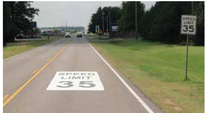
Figure 17: Elongated Speed Limit Sign Markings

Both the colored gateway treatment and the elongated-sign marking treatment are experimental, but do show promise for reducing speeds in certain situations. Additional investigation into their use in the future may help to establish them as viable lower-cost speed-reduction safety treatments. ■