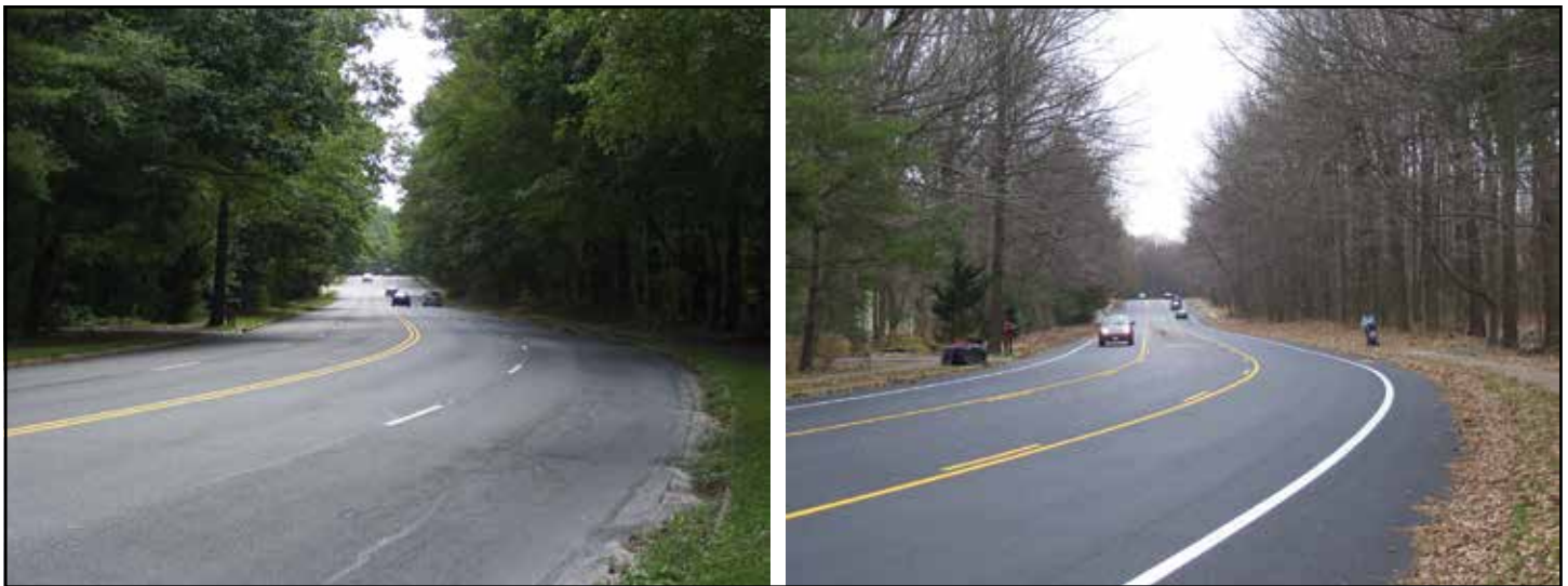
Figure 23: Road diet, before (left) and after (right)

Statistically significant reductions in total crashes were found for each sample individually and for all sites combined. The Iowa sample showed a 47 percent reduction in total crashes; the California and Washington samples showed a 19 percent reduction in total crashes, and the combined sample showed a 29 percent reduction in total crashes. Based on the analysis results, the researchers suggest using crash reduction factors in accordance with the different treatment environments and traffic volumes present in the two sample types. Roads in higher-population settings (with potentially higher traffic volumes) may expect crash reductions more in line with the 19 percent result, while roads in smaller cities (like the Iowa sites) may expect greater reductions of up to 47 percent. ■