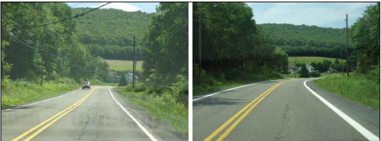
Figure 27: Wider edge-line markings