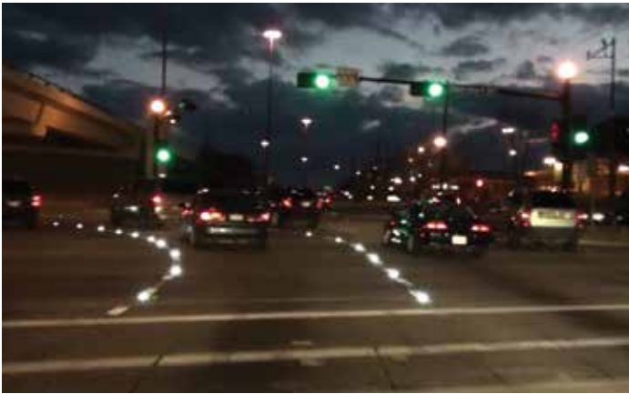
Figure 21: Lighted RPMs for turning lane delineation

A recent study investigated the use of lighted RPMs for turning-lane delineation in a multilane-turning situation at a traffic signal. Figure 21 shows the lighted RPMs used in the study during nighttime conditions.