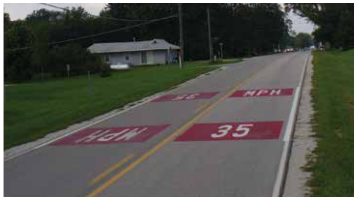
Figure 16: Colored gateway markings with speed limits

and 85th-percentile speeds were reduced after installing the colored gateway treatments. In general, moderate speed reductions of 1 mph to 2 mph were found following installation, but the proportion of vehicles exceeding the speed limit by 5 mph or more was greatly reduced. The proportion of vehicles going 40 mph or greater at the 35-mph treatment zone was reduced 30 percent to 49 percent. These reductions increased over time at one location and decreased slightly at the other location. The proportion of vehicles going 30 mph or greater in the 25-mph treatment zone was reduced by 30 percent one month after installation and 15 percent one year after installation.