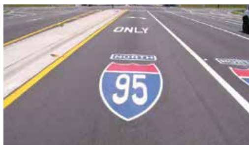
Figure 20: Route guidance markings

In 2009 researchers completed field evaluations of these types of markings at two interchange sites in Texas. One site received the symbol marking in addition to the appropriate cardinal direction where directional arrows and “ONLY” markings were already present. The other site received