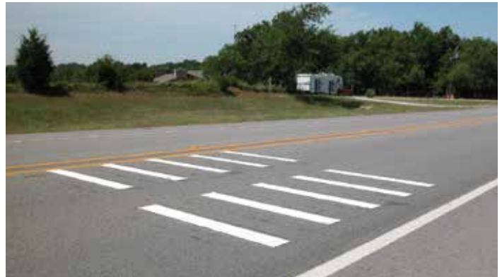
Figure 6: Transverse rumble strip marking

As with longitudinal raised markings, these raised transverse audible markings may be limited to warmer climates, as winter maintenance activities may damage raised markings. ■