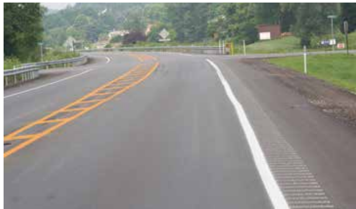
Figure 19: Lane narrowing via painted median

The use of hatch markings on shoulders and medians (between opposing traffic streams) is included in section 3B.24 of the MUTCD. ■