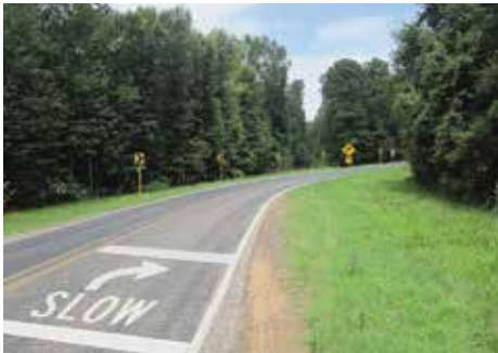
Figure 11: In-lane curve warning

The in-lane pavement curve warnings aim to inform the driver that a curve is ahead, thereby increasing the driver's awareness and possibly reducing speeds to keep vehicles on the road and in their lanes, and thus avoid crashes. The Pennsylvania DOT has installed in-lane curve warnings with the word "SLOW" as shown in Figure 11.