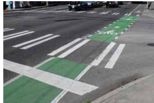
Figure 9: Intersection cycle track

One bike marking included in the MUTCD is the shared-lane marking, or sharrow, as shown in Figure 7. These markings are intended to alert motorists and bicyclists that they are sharing the roadway. These markings can be placed on roads with speed limits under 35 mph and should be placed 11 feet (to the center) from the curb face or the edge of the pavement on roads with on-street parallel parking and at least 4 feet from the edge of the road on streets with no on-street parking and a lane width less than 14 feet. The markings and placement are intended to prevent dooring crashes in situations with on-street parking, assist bicyclists with lateral placement in lanes too narrow to allow a vehicle to pass, alert drivers of the presence and position of bicyclists, encourage safe passing of bicyclists, and reduce wrong-way biking.