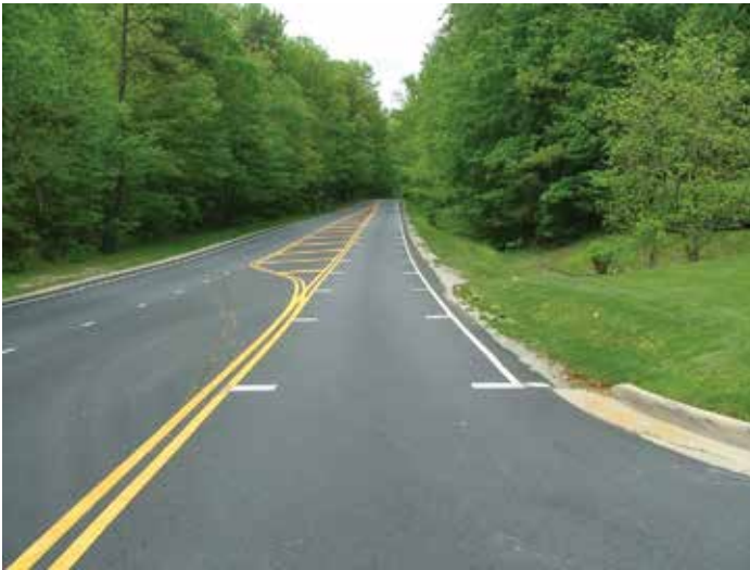
Figure 24: Optical speed bars

Similar to optical speed bars, the combined evaluation results of converging chevrons show promising results, with some studies showing diminishing results over time and others showing lasting speed reduction effects. The use of converging chevron markings is not covered in the MUTCD and likely requires experimental approval. ■