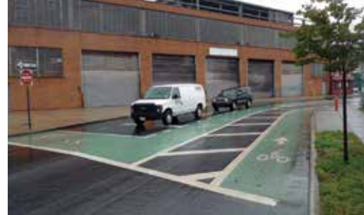
Figure 8: Bike box