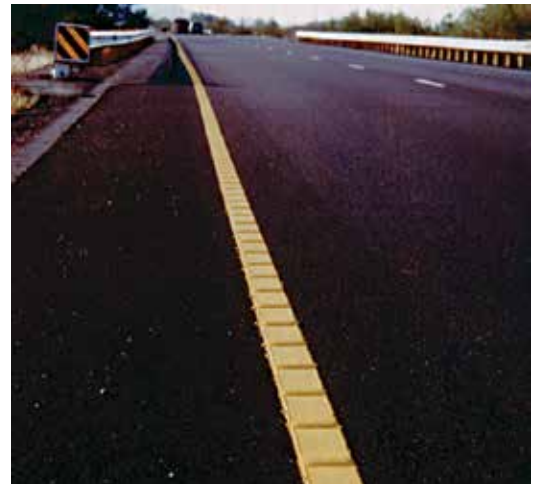
Figure 5: Profiled marking