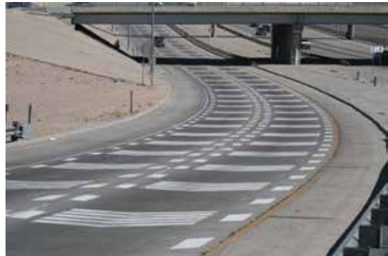
Figure 25: Converging chevrons