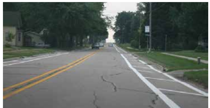
Figure 18: Lane narrowing via shoulder widening

The FHWA led an effort in 2008 to investigate the lane-narrowing concept at nine rural intersection locations around the United States on two-lane roads, with two-way stop control on the minor approaches. Sites from Florida, Kentucky, Missouri, and Pennsylvania were included in the evaluation. Sites with known speed issues or intersections that might be unexpected as drivers travel along the major road were chosen for the lane-narrowing treatment. The