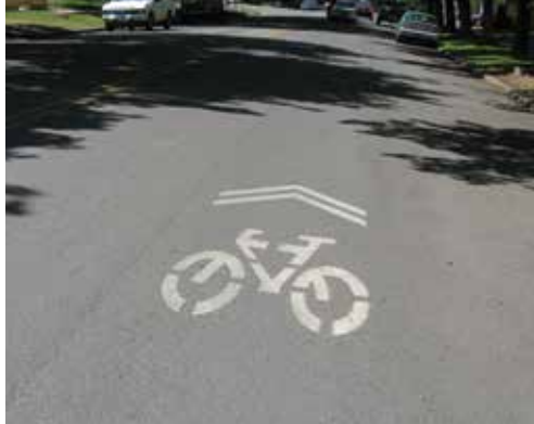
Figure 7: Sharrow