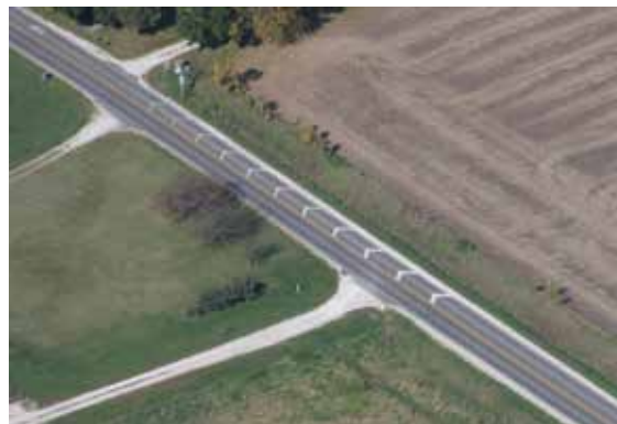
Figure 26: Converging chevrons